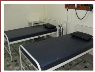
Beds recently purchased.